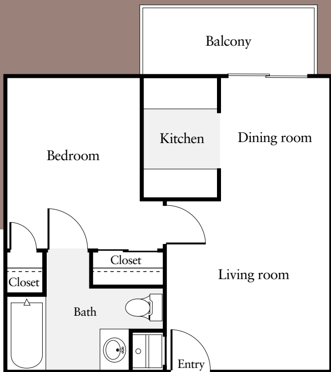
One bedroom/one bath