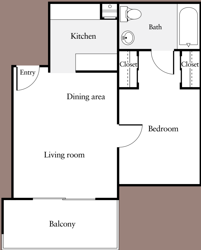
One bedroom/one bath