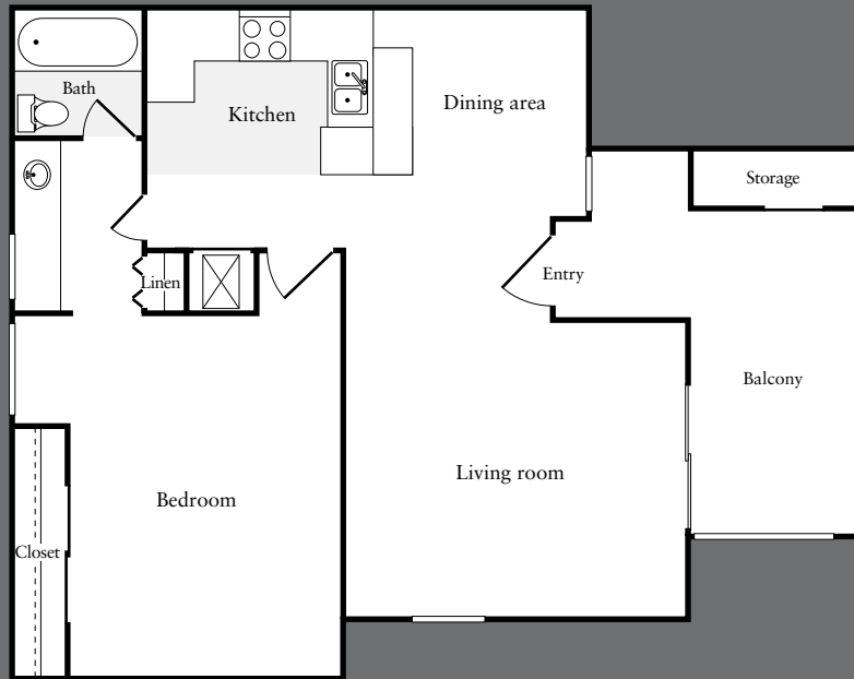
One bedroom / one bath 680 square feet