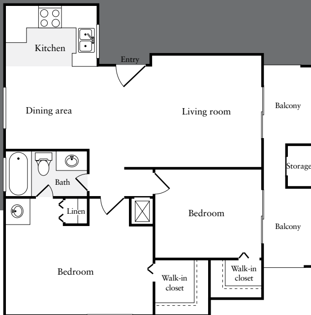
Two bedroom / one bath 850 square feet