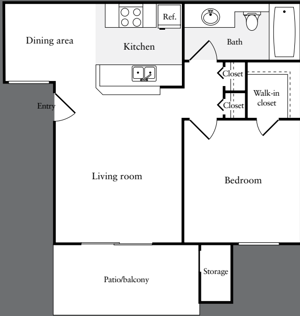
One bedroom / one bath 670 square feet