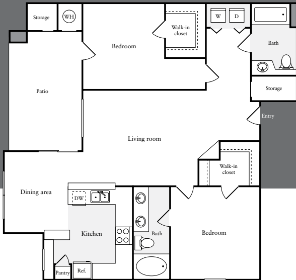
Two bedroom / two bath 1,092 square feet