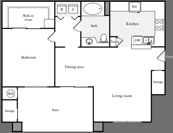
One bedroom / one bath 796 square feet