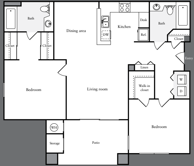
Two bedroom / two bath 1,007 square feet