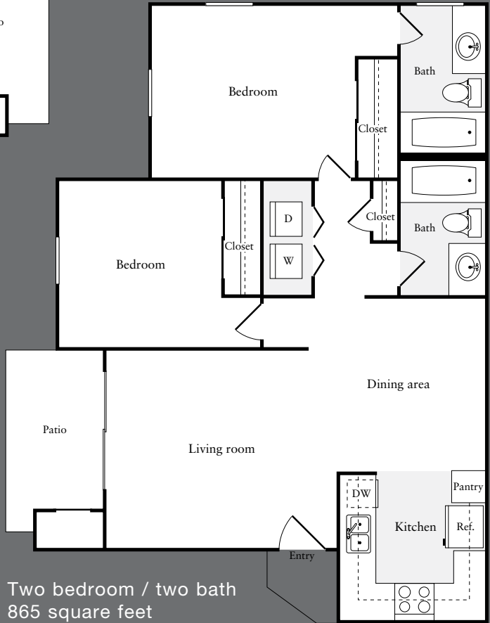
Two bedroom / two bath 865 square feet