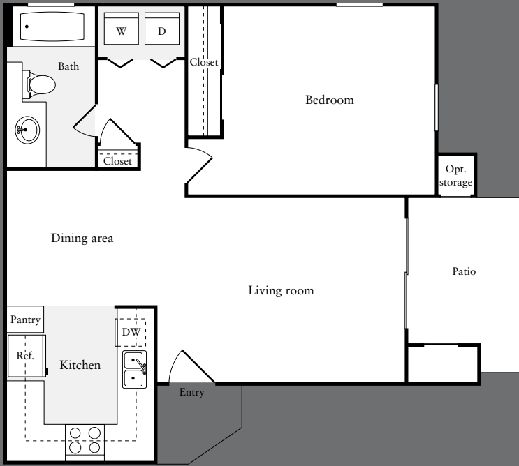
One bedroom / one bath 664 square feet