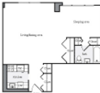
STUDIO, ONE BATH 610 SQUARE FEET