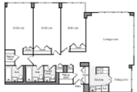
THREE BEDROOM, TWO AND A HALF BATH 1,403 SQUARE FEET