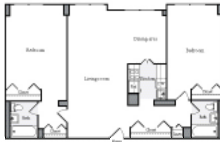
TWO BEDROOM, TWO BATH 1,139 SQUARE FEET