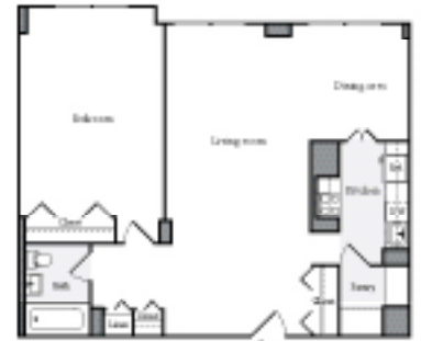
ONE BEDROOM, ONE BATH 818 SQUARE FEET