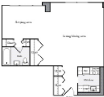
STUDIO, ONE BATH 610 SQUARE FEET